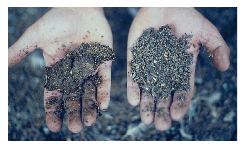
Left sample: too wet, not acceptable. Right sample: about right, acceptable.